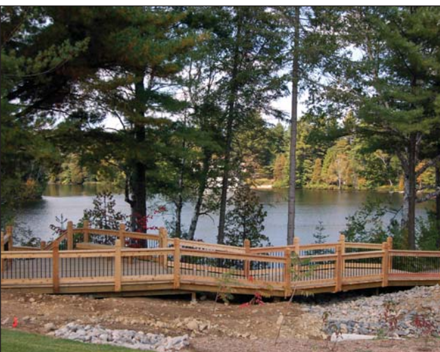
View of a stunning cedar bridge and waterfront overlook at The Landscapes.