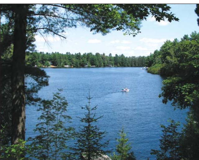
Lake view from The Landscapes

The Landscapes welcomed its very first enthusiastic and proud Phase 1 Owners and their guests this past summer. Barry Singleton, President & CEO, reminds potential purchasers that also included in Phase 1 is The Clubhouse. "I love the design and functionality this building offers" says Singleton. "It'll have a floor-to-ceiling Muskoka fireplace, a relaxing Library Loft overlooking the lounge and billiards table and beautiful French doors will open to a broad outdoor deck and patio. A great place to relax, greet other Owners or just watch an amazing Muskoka sunset."